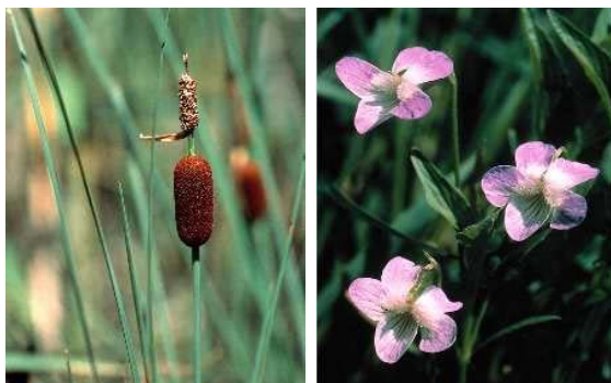
Typha minima Endangered in Central Europe

→ Compilation of “Species conservation data sheets” for these 140 species in cooperation with the ZDSF-Publication FOEN 1999.