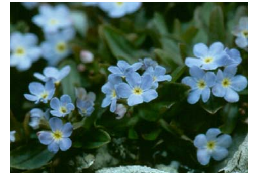
Myosotis rehsteineri , a species endangered worldwide, now only to be found in Switzerland at Lake Constance

Commissione svizzera per la conservazione delle piante selvatiche